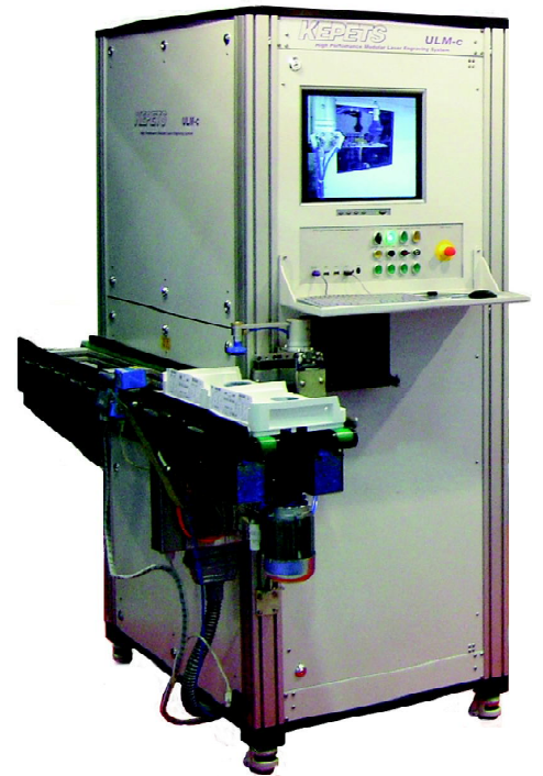
ULM-c Operation Costs - at 1000 km from Frankfurt

Lowest... Capital Investment Operation costs Space requirement Maintenance